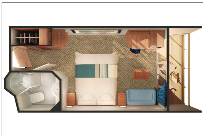
Balcony Stateroom 3D