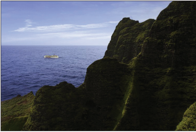
Na Pali Coast