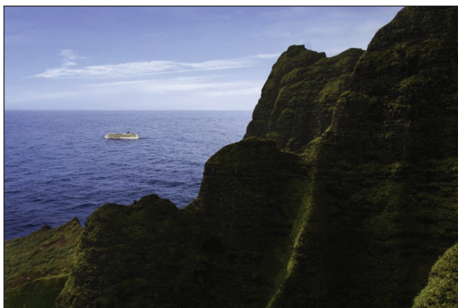
Na Pali Coast