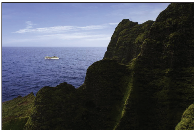
Na Pali Coast