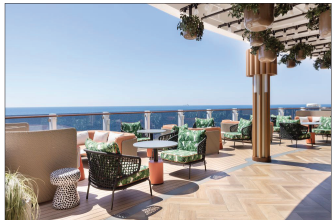
Indulge Outdoor Restaurant