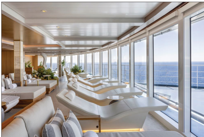
Spa - Thermal Lounge