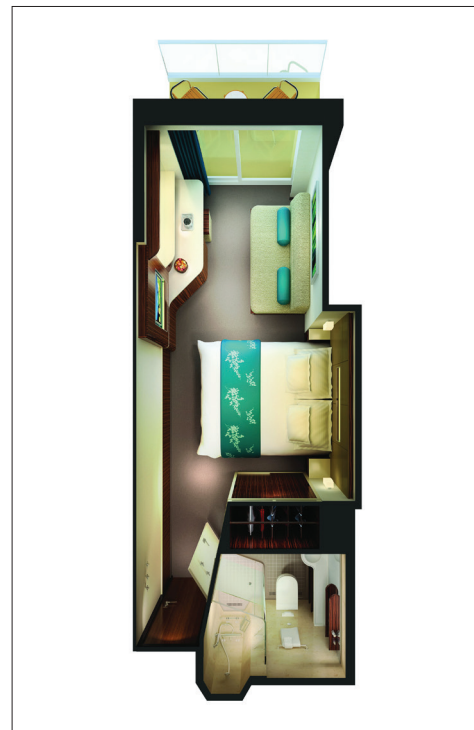
Balcony Cabin 3D