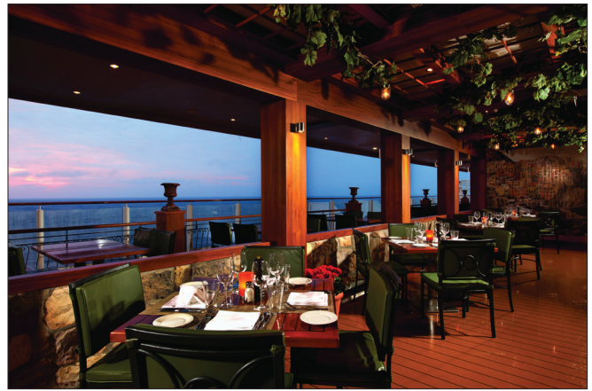
La Cucina Restaurant