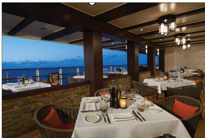
La Cucina Waterfront Restaurant