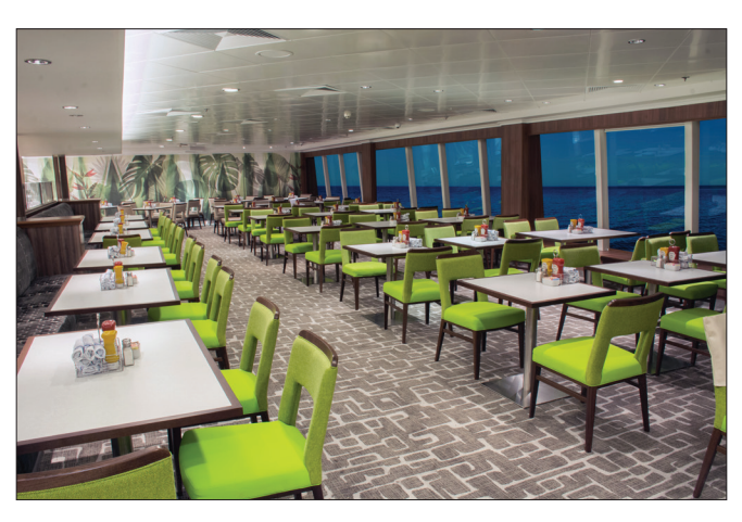
Garden Café (Buffet)