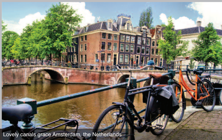
Lovely canals grace Amsterdam, the Netherlands