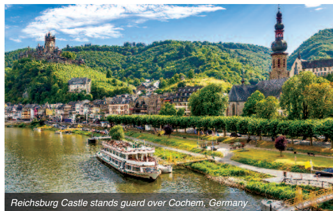
Reichsburg Castle stands guard over Cochem, Germany

This morning after breakfast you arrive in Cochem where along the beautiful Mosel River, countless vineyards with varying shades of green and squares of grapevines unfold before your eyes. Cochem, rated one of the prettiest villages along the Mosel, is best known for its fortified gates, pastel-colored or half-timbered buildings, Baroque towers and vintages of Mosel Riesling wine. Enjoy an included guided tour of the 19th-century Reichsburg Castle with its many spires and mighty brick walls that provide contrast to the surrounding lush vegetation.