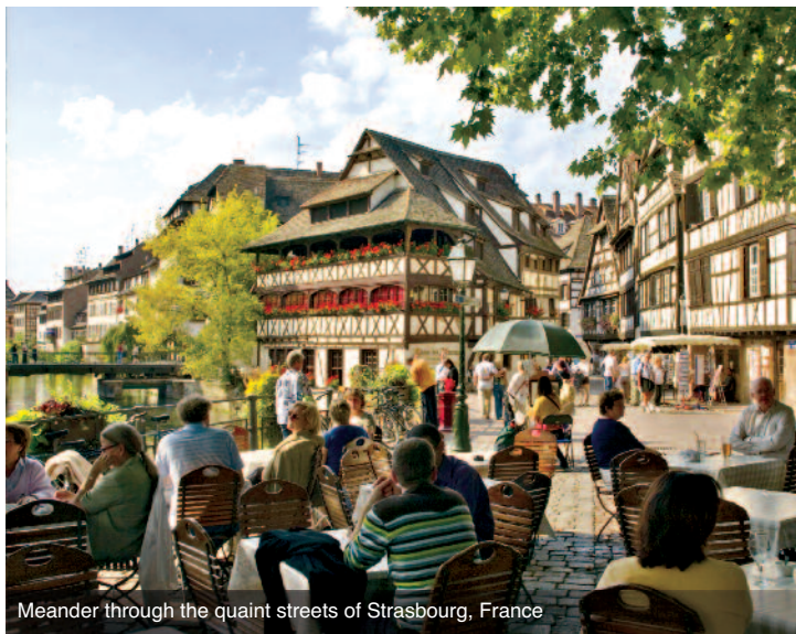
Meander through the quaint streets of Strasbourg, France