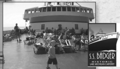
SS Badger - Lake Michigan Ferry

★ ★ ★ ★ SEE TOUR HIGHLIGHTS ON BACK SIDE! ★ ★ ★ ★