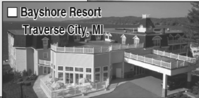
Bayshore Resort Traverse City, MI